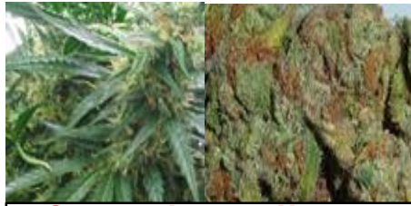
Cannabis, marijuana, hemp