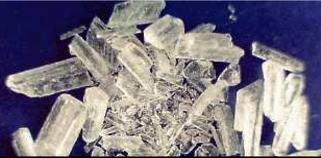
Stimulants Methamphetamine Amphetamine

*Use of cannabis in Japan, and the export of New Psychoactive Substance (NPS) from Japan are not prohibited by the current laws.